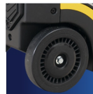
Heavy Duty Wheel 12.7cm Ø