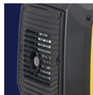
Muffler & Blind Window