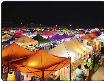
Market Trading & Business