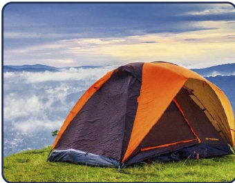
Camping & Recreational